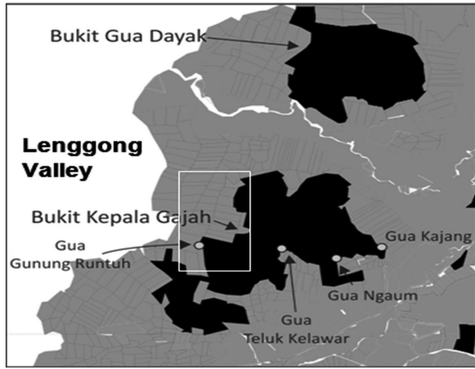
FIGURE 1. Location of Lenggong Valley, Perak and the study site Bukit Kepala Gajah area