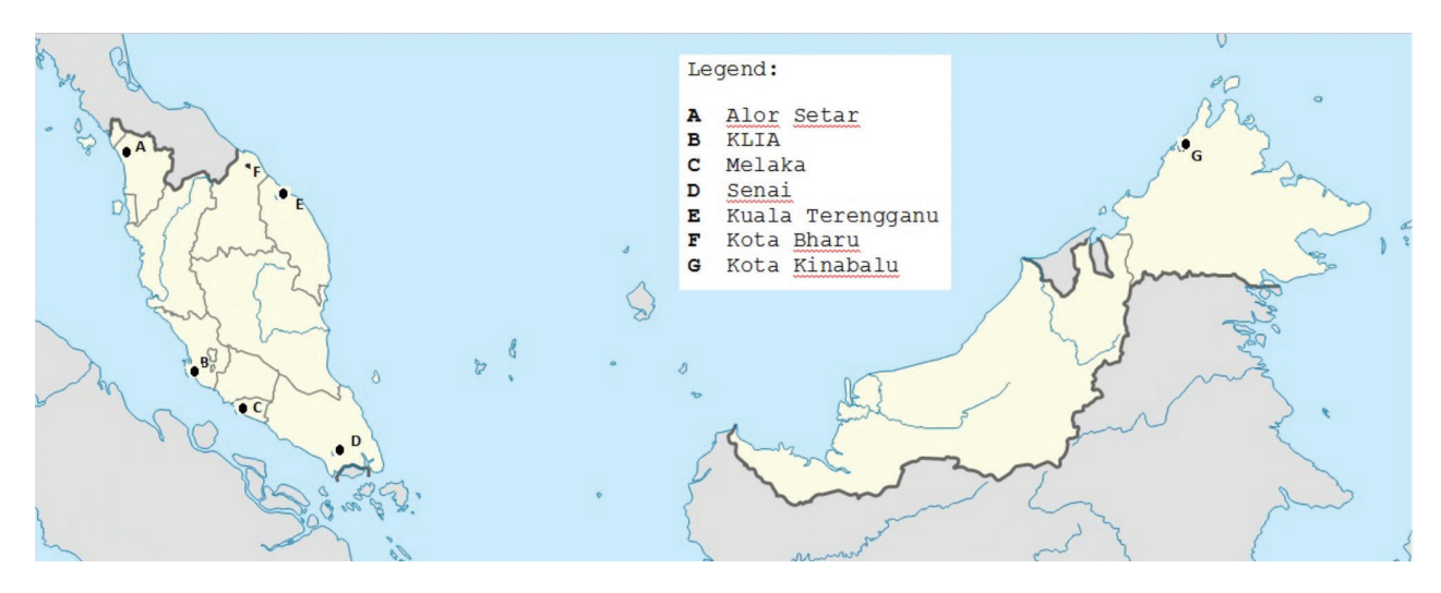
FIGURE 1. Malaysia Map