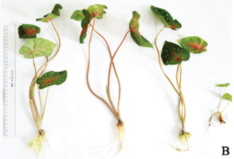
JG: Japan Garden formula; SCAU-B: South China Agriculture University formula B for leafy vegetables

FIGURE 2. Growth of in vitro 'Red Flash' caladium plantlets after 30 days of acclimatization in Hoagland nutrient solution by using a static hydroponics system (A) and plant morphological characteristics of the plantlets after 30 days of hydroponic culture in JG, SCAU-B, Hoagland solution and deionized water, respectively (from left to right) (B)