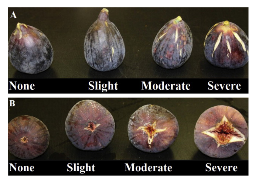
FIGURE 2. Skin damaged of fig fruit (A) Skin cracking and (B) Ostiole-end splitting

using plastic syringe (Rosianski et al. 2016). The result showed that the pollinated common fig fruit retained its texture, taste and appearance after 14 days of storage whereby the control, parthenocarpic (fruit set or matured without seed development and without fertilization) fig fruit, has deteriorated (Figure 4) (Pallardy 2010; Rosianski et al. 2016). This result was due to pollinated common fig fruit has thicker cell wall than parthenocarpic fig fruit. The