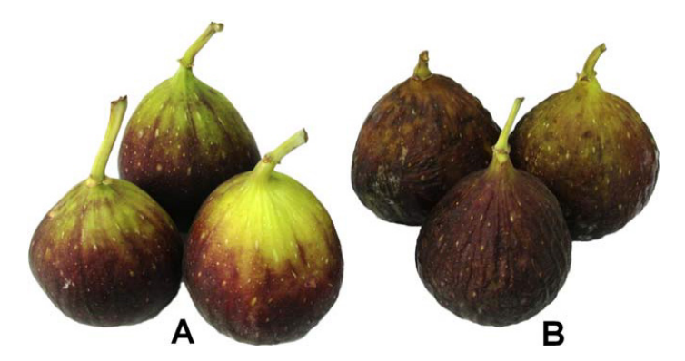
FIGURE 3. Fig fruits appearances that harvested at commercial stage after 12 days of storage and 2 days of shelf life (A) Treated with 1-MCP before harvest, and (B) Control