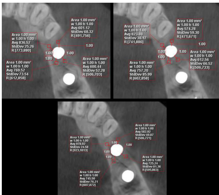
FIGURE 2. Axial view showing the region of interest of UVC group for measuring BD at day 0 (A), week 8 (B), and week 26 (C) (Romexis software)